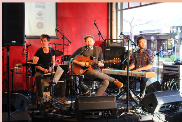
Sonic Delusion playing at the Fête de la Musique 2017

Every year since 1982, French people gather in the streets of the country to enjoy free concerts and celebrate the arrival of summer. This year again we want to share this event, an important part of French culture, with you!